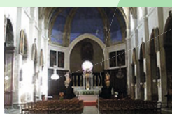
Église Saint-Symphorien-les-Carmes - Avignon