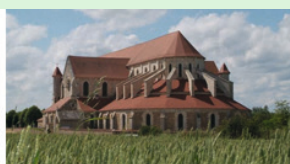
Abbaye de Pontigny