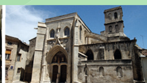
Église Saint-Agricol - Avignon