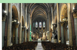
Abbaye de Pontigny